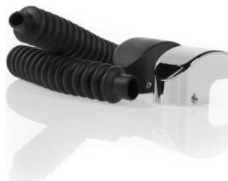
Clutch Arm Finisher