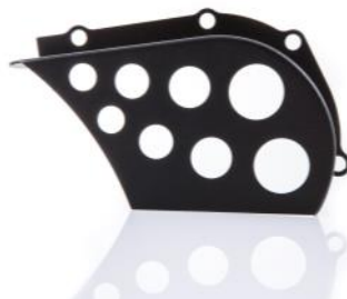
Counter Sprocket Cover