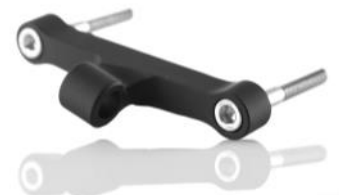
Clutch Cable Bracket