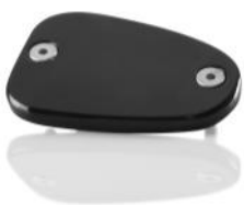
Master Cylinder Cover