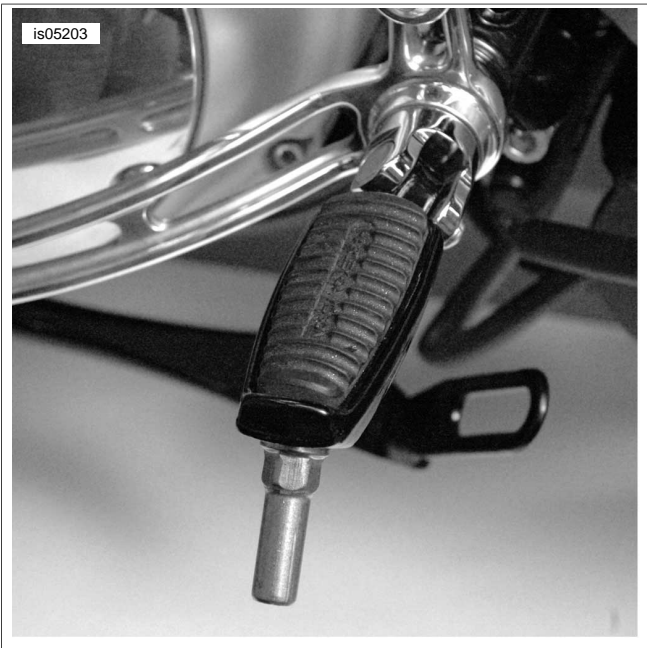
Figure 2. Correct installation (generic footpeg and wear tip)