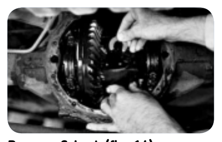
Remove C-Lock (fig. 14).