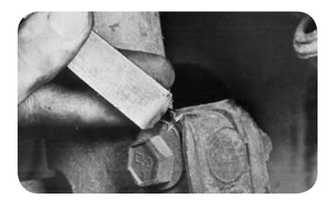
Ford and Chrysler - Mark cam position before disassembly (fig. 26).