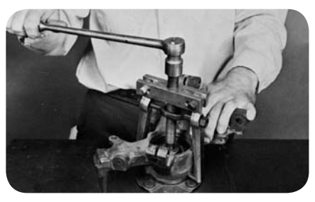
Ford - Grip and remove knuckle from hub (fig. 32).