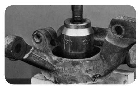
Chrysler - Use socket to press out old bearing (fig. 30).