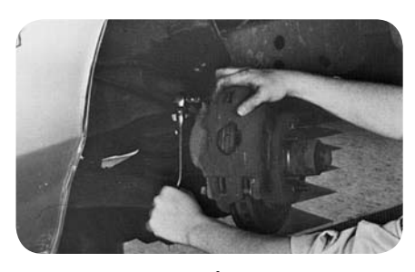
Loosen brake caliper mounting bolts (fig. 1).

10. Match the part number of the old bearing to select the correct SKF replacement.