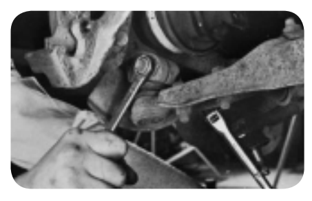
Chrysler - Tighten lower control arm attaching bolt (fig. 36).