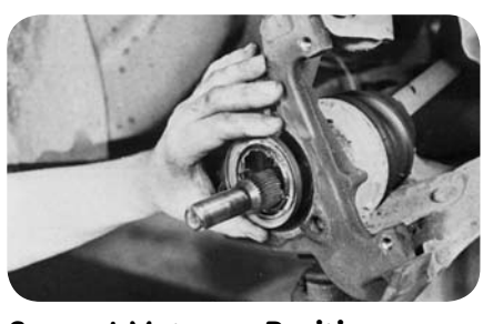
General Motors - Position new seal in bore (fig. 31).