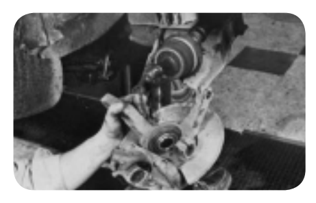
Ford and Chrysler - Place knuckle assembly on ball joint stud (fig. 35).