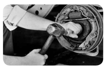
Tap new bearing into shaft cavity (fig. 20).