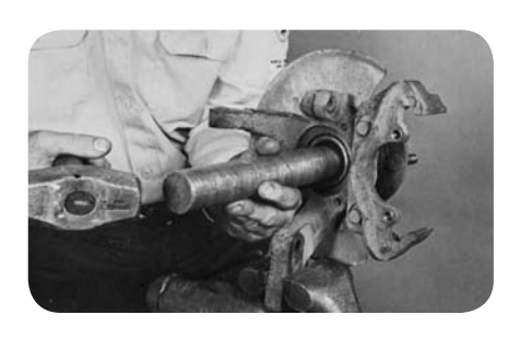
Chrysler - Remove hub from knuckle (fig. 29).