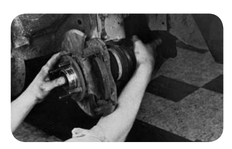
General Motors - Push shaft into hub (fig. 37).