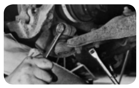
Ford and Chrysler - Loosen bolt on lower control arm (fig. 25).