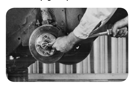
Tighten hub nut while applying brakes (fig. 38).