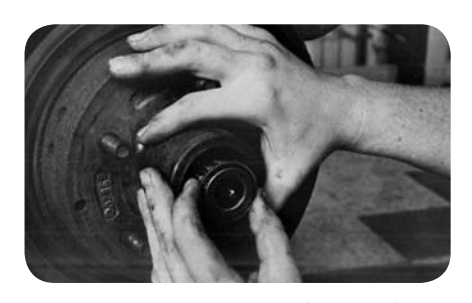
Install outer bearing (fig. 12).