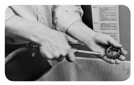
Compressed air may be used to dry cleaned bearing (fig. 6).