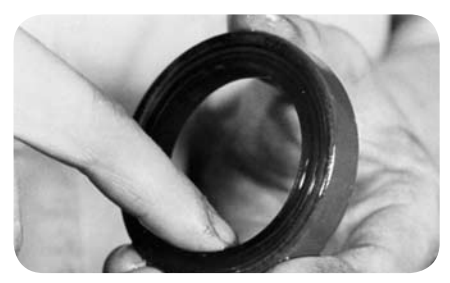
Apply lube to seal lips (fig. 43).