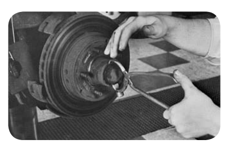
Pull off dust cover (fig. 2).