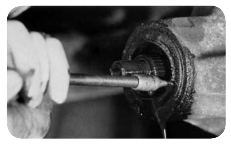
Pry out old pinion seal (fig. 41).