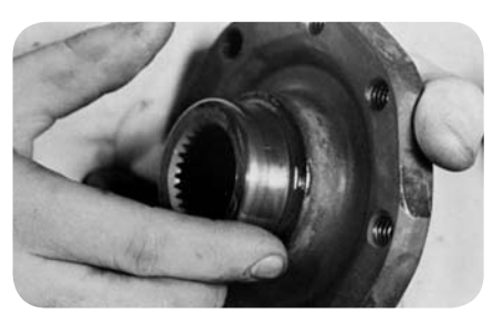
Inspect pinion yoke seal surface (fig. 42).