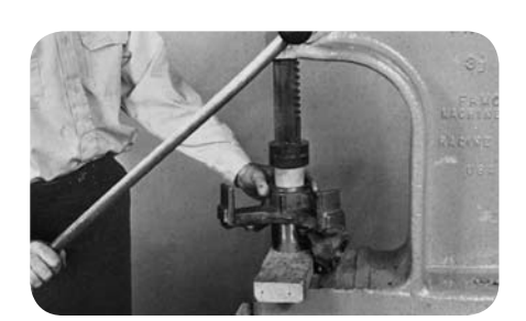
Ford - Use arbor press to install new bearing in hub (fig. 34).