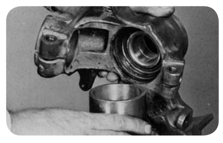
Ford - Place knuckle assembly over spacer tool (fig. 33).