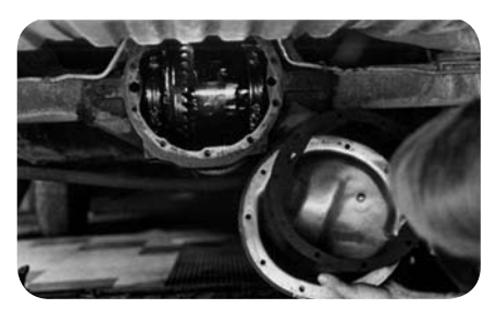
Replace differential cover with new gasket (fig. 21).