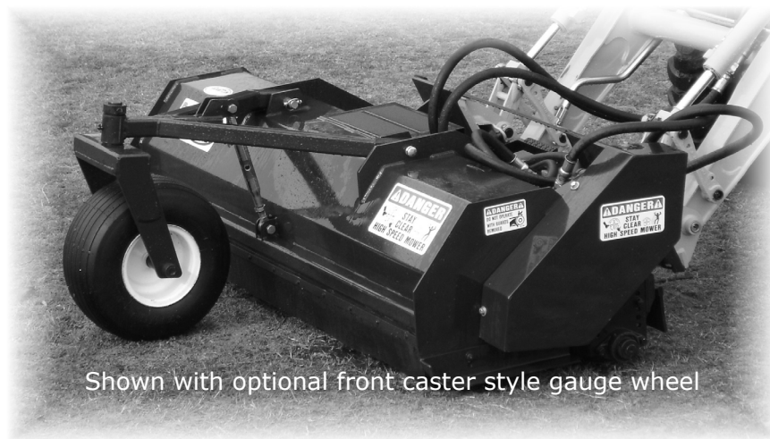
Shown with optional front caster style gauge wheel

Model No. 48F Suggested List Price $6,490