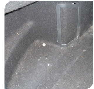
These images show examples of unacceptable damage