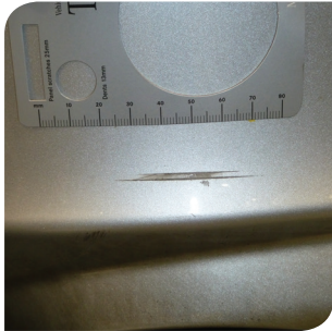
These images show examples of unacceptable damage

There will be no charge for light damage. The most severe dents will be repaired as cost effectively as possible, but damage that has penetrated the base coat will be charged. Any vehicle wraps or livery will need to be removed and the vehicle returned to its original factory colour.