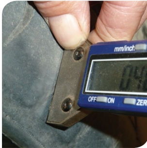
These images show examples of unacceptable damage