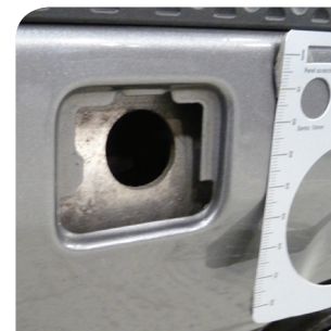
These images show examples of unacceptable damage