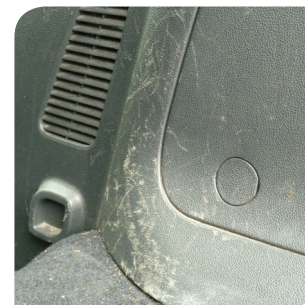
These images show examples of unacceptable damage