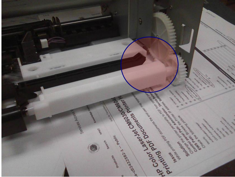
The tab is broken on this paper pick assembly above.