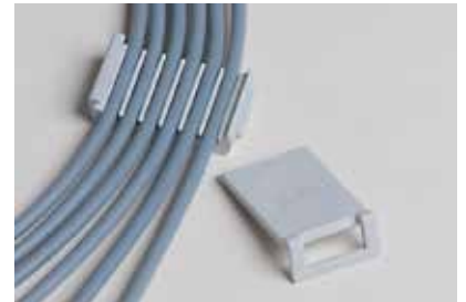
4-wire Cable Comb 21300-008054 (10/pack)

6-wire Cable Comb 21330-008055 (10/pack)