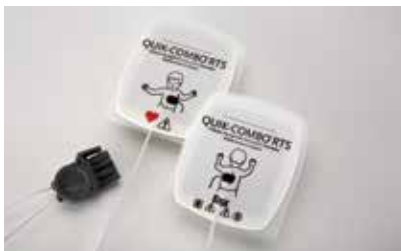
Pediatric EDGE System RTS Electrodes with QUIK-COMBO Connector

For use only with manual monitor/defibrillators; 12 month minimum shelf life at time of shipment.