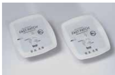
EDGE System Electrodes with FAST-PATCH Connector

Must be used with QUIK-COMBO to FAST-PATCH Adapter Cable (11110-000052)