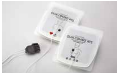
EDGE System RTS (Radiotransparent) Electrodes with QUIK-COMBO Connector