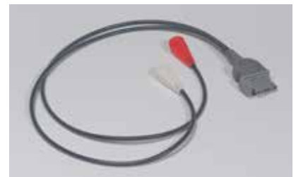
FAST-PATCH® Adapter Cable

For use with the QUIK-COMBO therapy cable