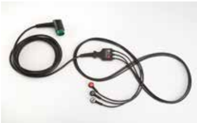
3-Wire ECG Cable Right-angle connector 11110-000029

6-wire Cable Comb 21330-008055 (10/pack)