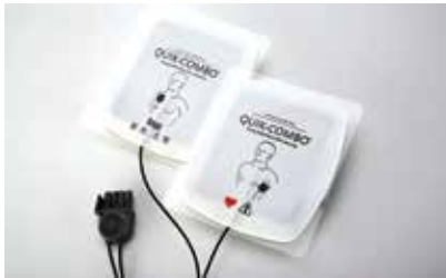
EDGE System Electrodes with QUIK-COMBO Connector

18 month minimum shelf life unless specified