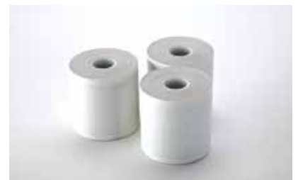
Strip Chart Recorder Paper 11240-000016 (100mm x 22m 2 rolls/box) 11240-000013 (50mm x 22m 2 rolls/box)