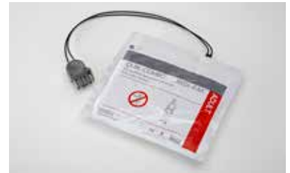
EDGE System Electrodes with QUIK-COMBO Connector and REDI-PAK™ Preconnect System