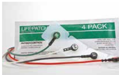
LIFE-PATCH ECG Electrodes Adult, pregelled. 11100-000002 (4/pack)