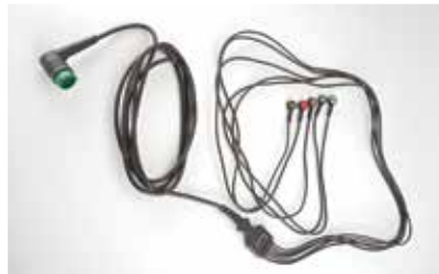
5-Wire ECG Cable Right-angle connector, 4-wire limb plus 1 chest lead, labeled "V1". 11110-000066