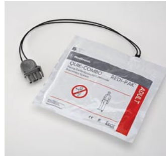
EDGE System Electrodes with QUIK-COMBO Connector and REDI-PAK™ Preconnect System