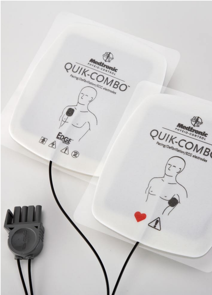
EDGE System Electrodes with QUIK-COMBO Connector ..... 11996-000091

18-month minimum shelf life remaining at time of shipment from Physio-Control except where noted.