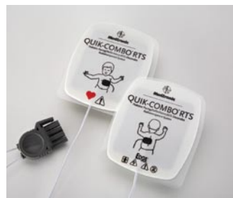
Pediatric EDGE System RTS Electrodes with QUIK-COMBO Connector

For use only on manual defibrillator/monitors, 12-month minimum shelf life at time of shipment.