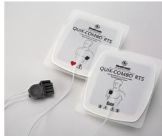
EDGE System RTS (Radiotransparent) Electrodes with QUIK-COMBO Connector