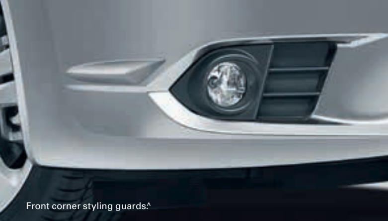
Front corner styling guards ^