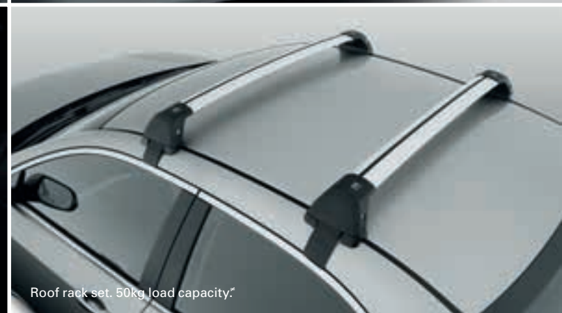
Roof rack set. 50kg load capacity. ¶