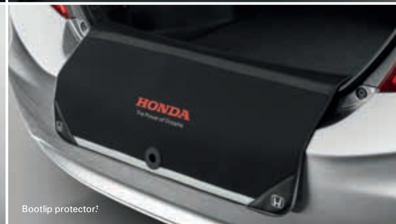
Bootlip protector. †