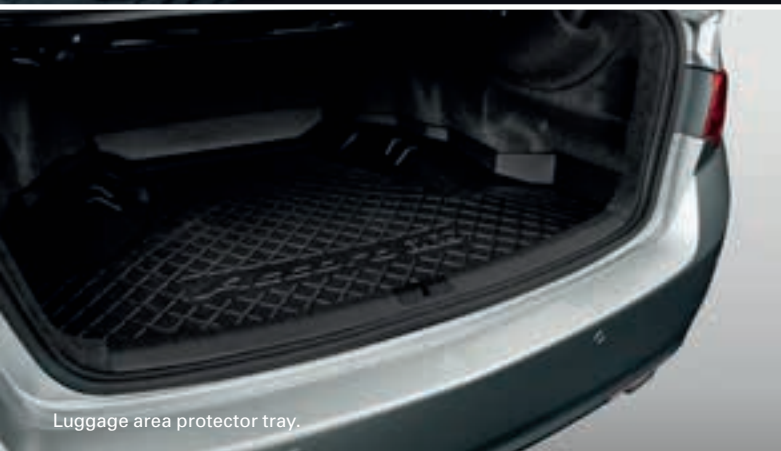
Luggage area protector tray.