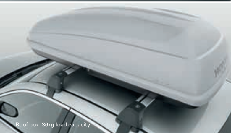
Roof box. 36kg load capacity.