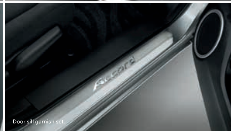
Door sill garnish set.