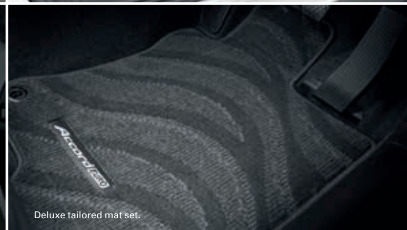
Deluxe tailored mat set.