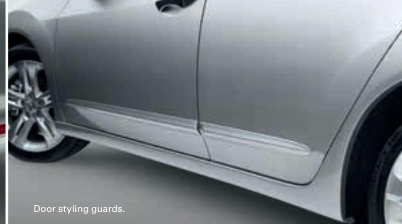
Door styling guards.