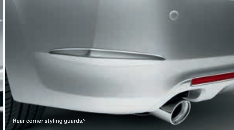
Rear corner styling guards ^