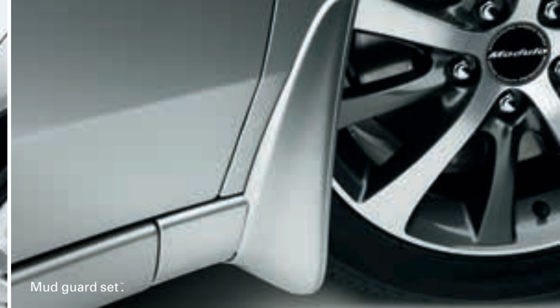
Mud guard set. ‡