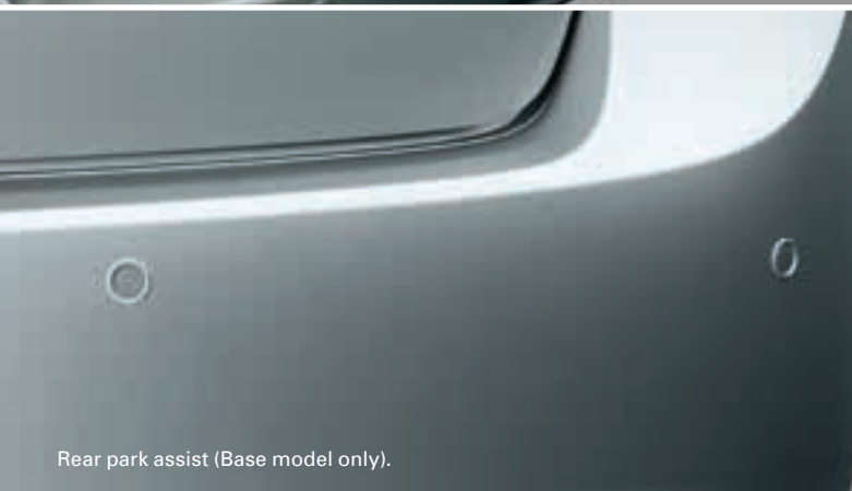
Rear park assist (Base model only).