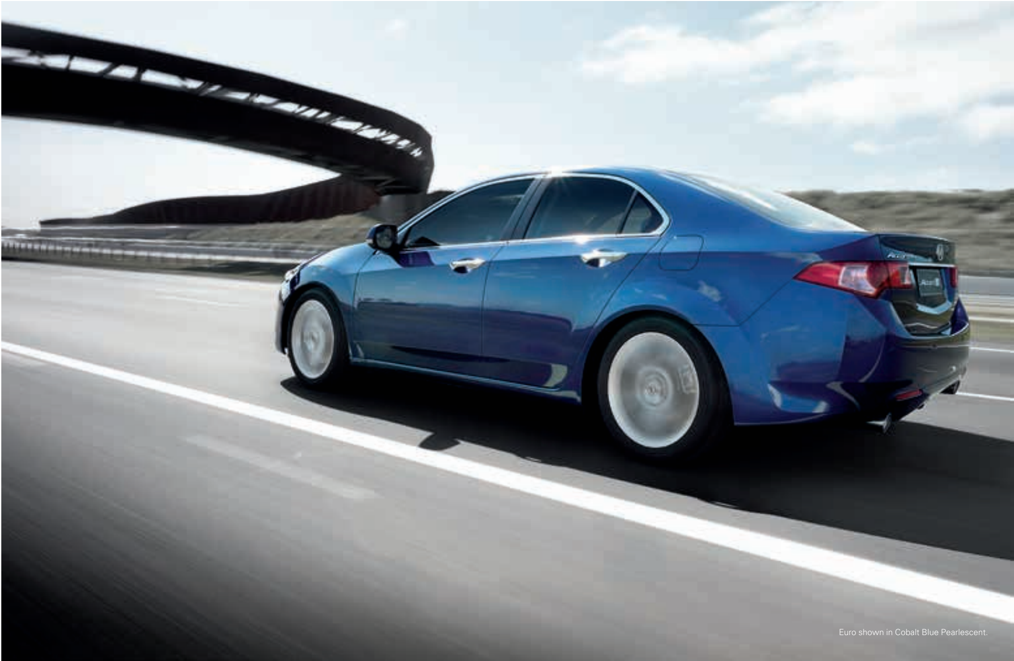
Euro shown in Cobalt Blue Pearlescent.