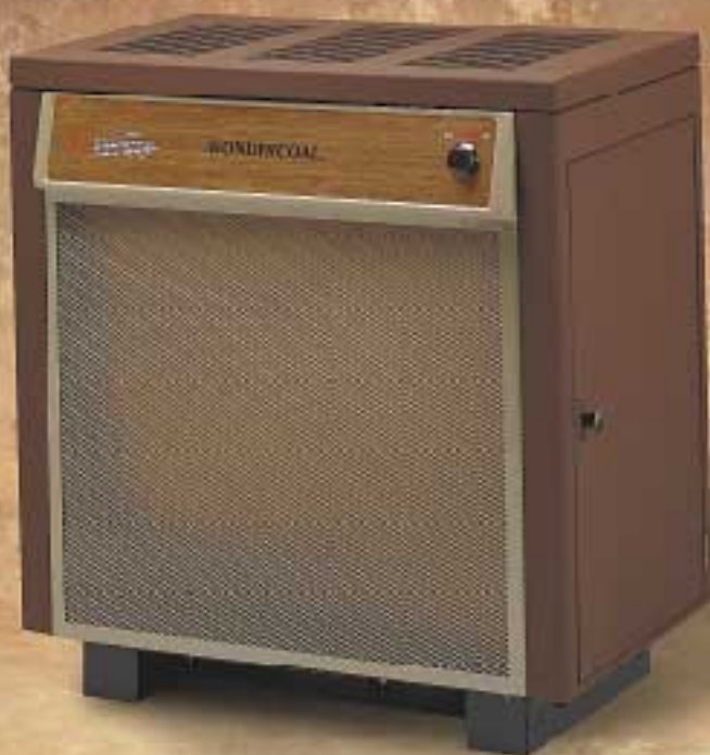
WONDERCOAL CIRCULATOR - MODEL 2827