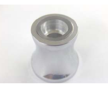
Shift Spacer with spring washer

necessary, before tightening anything down. On heel/toe shifters, the toe shifter will sit slightly in front of the board, while the heel shift will sit just above the rear of your board to ensure consistent shifting. Once all adjustments are made, tighten completely.