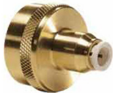
Fig. 3 Garden hose adapter