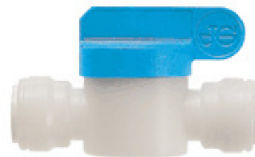
Fig. 6 Inline ball valve

T A P M A S T E R M O U N T I N G T E M P L A T E