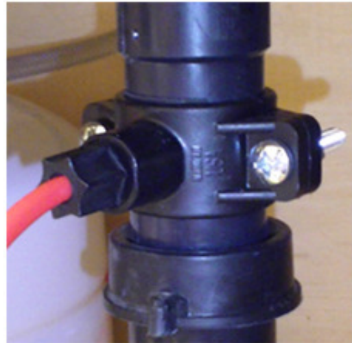
Fig. 5 Drain saddle