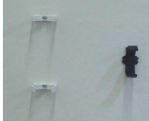
Fig. 4 Mounting clips for Tap Master & permeate pump