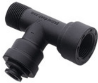
Fig. 2 EZ adapter