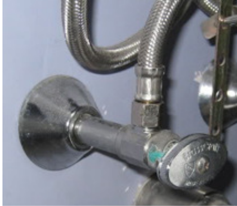
Fig. 1 Angle stop