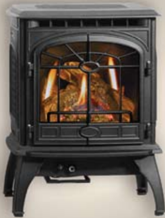
Shown in black finish

Don't let its size fool you—the Garnet-T is a champion. It's a little heater with a big heart. A diminutive footprint and impressive design features combine to make this smallest member of the Quadra-Fire family perfect for the bedroom, den or dining room. The Garnet-T is designed to be both attractive and economical, devoted to the zone heating concept—heat the space you're in, not the entire house.