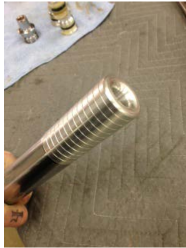
30" Misfit Short Neck