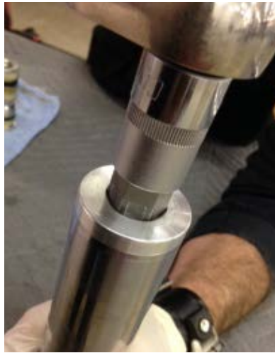
26" Misfit Short Neck