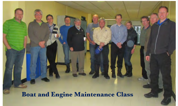
Boat and Engine Maintenance Class

Through the years, Bay of Quinte Squadron has served Quinte and surrounding areas. It was not uncommon from the early 1980's up to 2001 to offer two Boating classes per year with an average number of students per class being 40 plus. In the past 60 years, hundreds of people have had some type of boating safety courses with our Squadron. The introduction of the Pleasure Craft Operator Card in 1999 seriously affected the original Boating Course. Some safety and serious minded boaters still have opted to take time to learn more than is provided by obtaining the PCOC. The training program is offered in September and January. We offer various courses to suit the needs of the local boaters. The Basic Boating and the follow up Boating Essentials are always offered in each semester. Persons holding a Pleasure Craft Operator's Card from any other source other than CPS may enroll in the follow up course Boating Essentials. Boating Essentials contains a multitude of information to keep you and your family safe while enjoying boating.