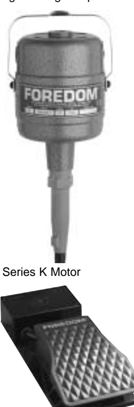
FCT2-CE Foot Speed Control

This instruction manual contains instructions for the assembly, operation, and servicing of the Foredom power tools shown at right.