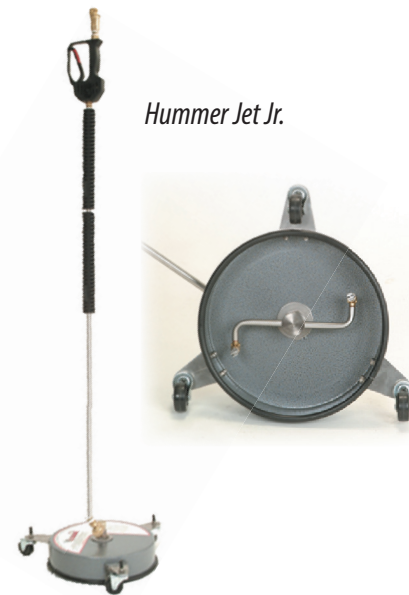
Hummer Jet Jr.