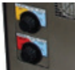
Chemical Metering Selectors

Chemical Metering Selectors: This control allows the operator to select a chemical to be injected and meter it into the low-pressure spray. It also provides a means to flush the chemical injector after each use. The chemical metering selector is located on the lower left front corner of the SMT -600PEW. Turning the selector knob from the off position counter-clockwise selects and meters the chemical. The further the control knob is turned, the higher chemical concentration out the spray gun. See the chemical dilution cart and instructions on page 8 of this manual. To flush the chemical injector, turn the metering knob on one valve to off and set the other valve fully clockwise. Operate the spray gun and pump on low pressure for one minute.