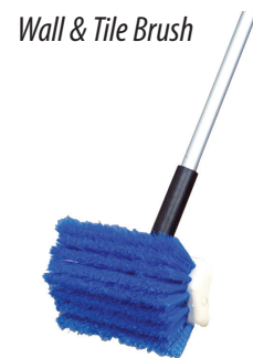
Wall & Tile Brush