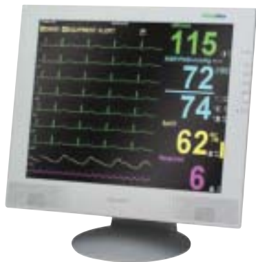
008-0937-00 17 in. Color Display for Propaq LT Interface