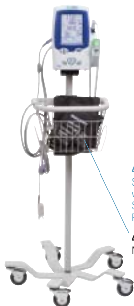
45NT0-E1 Spot Vital Signs® LXi with SureBP, Nellcor SpO 2 , and SureTemp Plus Thermometer