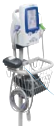
45NT0-E1 Spot Vital Signs® LXi with SureBP, Nellcor SpO 2 , and SureTemp Plus Thermometer