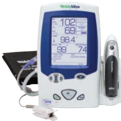
45NE0-E1 Spot Vital Signs LXi with SureBP, Nellcor SpO 2 and Braun ThermoScan PRO 4000 Thermometer