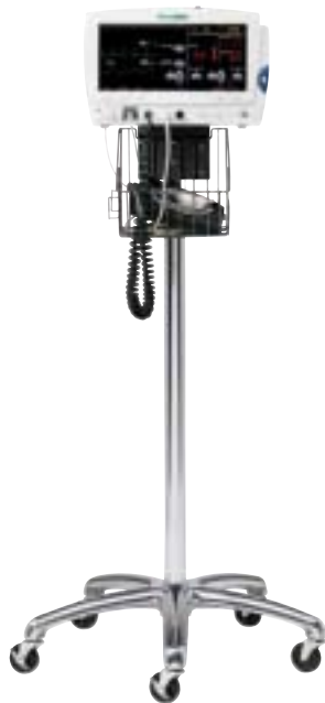
6200-30 Mobile Stand