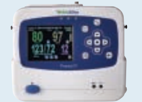
802LTRN-CE1 Propaq® LTR with Wireless Option/ Charging Cradle—120 NA