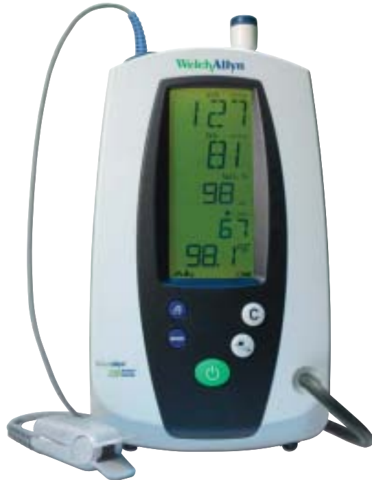
42NTB-E1 Spot Vital Signs® with NIBP, Nellcor Pulse Oximetry and SureTemp Thermometer