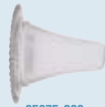
05075-800 Disposable Probe Covers