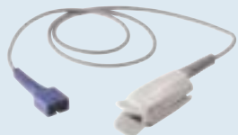
DS-100A Durasensor Adult Oxygen Transducer