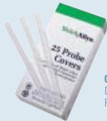
05031-101 Disposable Probe Covers