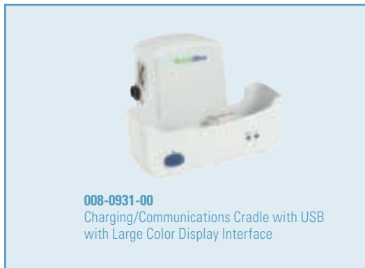
008-0931-00 Charging/Communications Cradle with USB with Large Color Display Interface