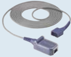
DEC-8 Extension Cable (8 ft)