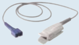
DS-100A Durasensor Adult Oxygen Transducer