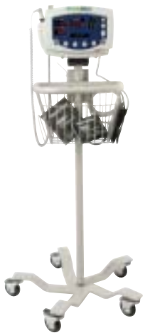
53NT0-E1 Vital Signs Monitor 300 Series, NIBP, Nellcor Pulse Oximetry, SureTemp Plus Thermometer 008-0835-01 Mobile Stand