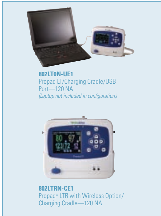
802LTON-UE1 Propaq LT/Charging Cradle/USB Port—120 NA (Laptop not included in configuration.)