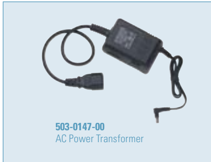
503-0147-00 AC Power Transformer