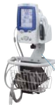
45NE0-E1 Spot Vital Signs® LXi with SureBP™, Nellcor SpO 2 and Braun ThermoScan PRO 4000 Thermometer