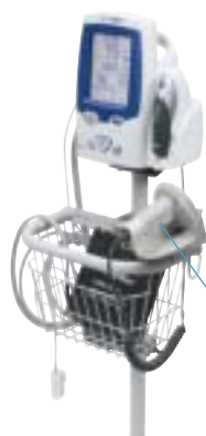
45ME0-E1 Spot Vital Signs® LXi with SureBP, Masimo SpO 2 , and Braun ThermoScan PRO 4000 Thermometer