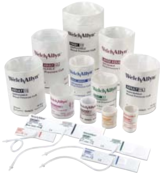
NIBP Disposable One-Piece Blood Pressure Cuffs