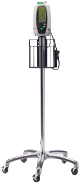
4200-60 Mobile Stand with Basket

MULTIPARAMETER SPOT CHECK DEVICES AND MONITORS