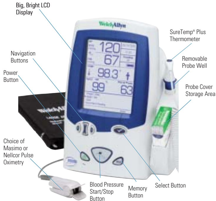
45NT0-E1 Spot Vital Signs LXi with SureBP, Nellcor SpO 2 , and SureTemp Plus Thermometer

MULTIPARAMETER SPOT CHECK DEVICES AND MONITORS