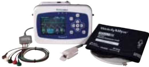
802LTON Propaq LT