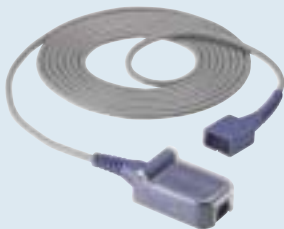
DEC-8 Extension Cable (8 ft)