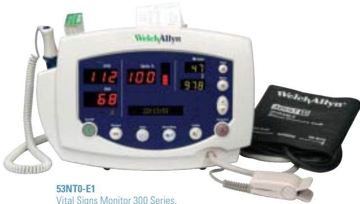
53NT0-E1 Vital Signs Monitor 300 Series, NIBP, Nellcor Pulse Oximetry, SureTemp Plus Thermometer