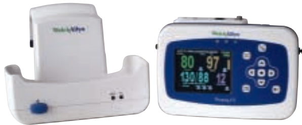
802LTON-CE1 Propaq® LT/Charging Cradle—120 NA

MULTIPARAMETER SPOT CHECK DEVICES AND MONITORS