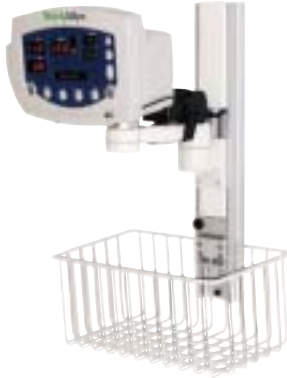
008-0834-01 Wall Mount