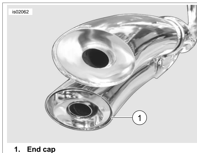
Figure 1. Apply Adhesive Disks to Endcap Bosses