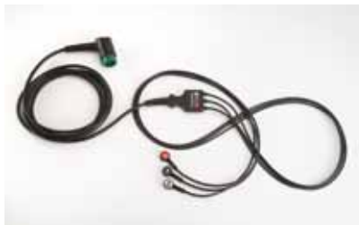
3-Wire ECG Cable