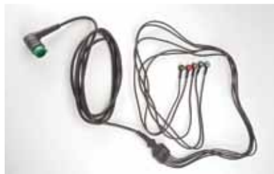
5-Wire ECG Cable

Right-angle connector, 4-wire limb plus 1 chest lead, labeled "V1". 11110-000066 AHA