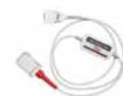
MNC-1 Adapter Cable

Allows LIFEPAK 12 defibrillator/monitor with Masimo SpO 2 to connect to Nellcor sensors. 11996-000183 (10ft) 11996-000198 (4ft)