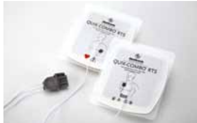
EDGE System RTS (Radiotransparent) Electrodes with QUIK-COMBO Connector