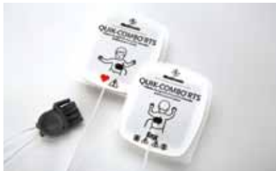
Pediatric EDGE System RTS Electrodes with QUIK-COMBO Connector

For use only with manual monitor/defibrillators; 12 month minimum shelf life at time of shipment. 11996-000093 (24" leadwire length)