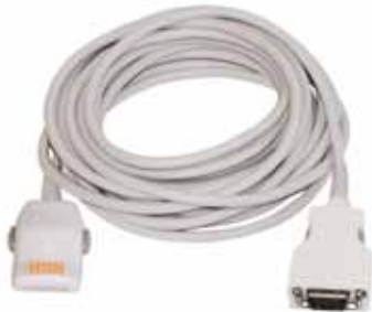
LNOP Patient Cable

11171-000006 (4ft) 11171-000008 (8ft) 11171-000009 (12ft)