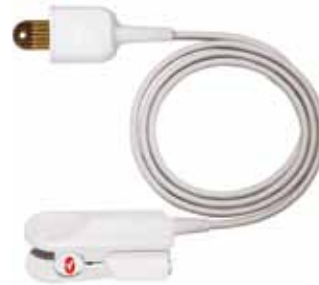
LNOP Reusable Sensor

11171-000006 (4ft) 11171-000008 (8ft) 11171-000009 (12ft)