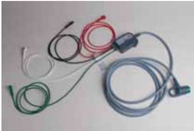
12-Lead ECG Cable Trunk Cable with 4-Wire Limb Leads

11111-000018 (5ft AHA) 11111-000020 (8ft AHA)