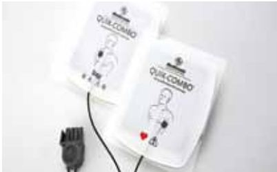
EDGE System Electrodes with QUIK-COMBO Connector

18 month minimum shelf life unless specified