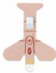
LNOP Adhesive Sensor

Single patient use. (20/box) 11171-000011 (Ad - Ref# 1001) 11171-000012 (Ped - Ref# 1025)