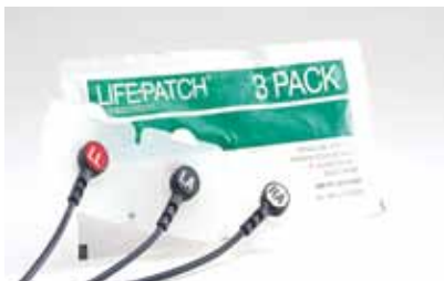
LIFE•PATCH ® ECG Electrodes

Right-angle connector, 4-wire limb plus 1 chest lead, labeled "V1". 11110-000066 AHA