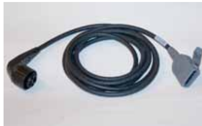
QUIK-COMBO Therapy Cable

For use only with manual monitor/defibrillators; 12 month minimum shelf life at time of shipment. 11996-000093 (24" leadwire length)