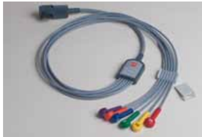
12-Lead ECG Cable 6-Wire Precordial Attachment

11111-000018 (5ft AHA) 11111-000020 (8ft AHA)