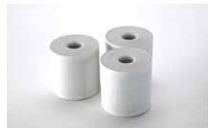
Box of Strip Chart Recorder Paper