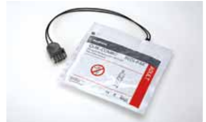
EDGE System Electrodes with QUIK-COMBO Connector and REDI-PAK™ Preconnect System