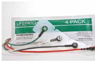
LIFE•PATCH ECG Electrodes