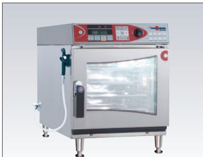
Shown with optional Hand Shower (CSH08).

* The "mini" will hold six 13" x 18" half size bake pans but is designed for optimal cooking results for three pans.