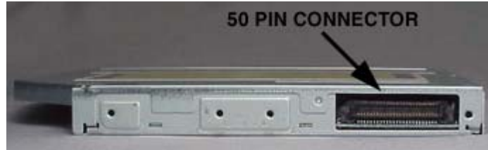
Figure 1. SD-C2612 DVD Writeable Drive Rear Panel – Connector

ATAPI Connector A 50-pin ATAPI interface connector is found at the rear of the SD-C2612 DVD-ROM drive. Connecting cable should use Japan Aviation Electronics Industry Limited KX14-50Series L or equivalent connector.