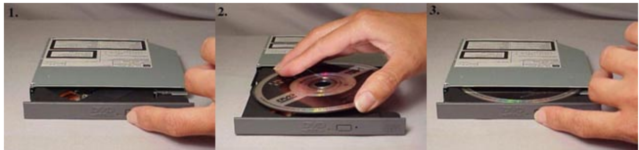
Figure 1. Inserting Disc

To insert a DVD in a DVD-ROM drive that is mounted horizontally, perform the following steps: