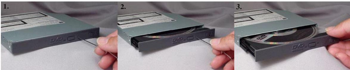
Figure 2.Using Emergency Eject