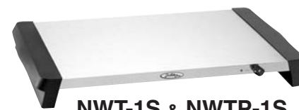
NWT-1S & NWTP-1S