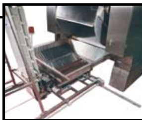
Optional Lateral Traveling System