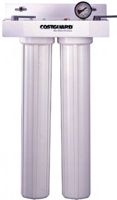
CGS-22 20" Dual Series Housing: DEV9100-22