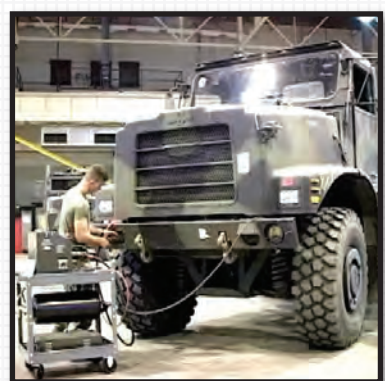
ONE PERSON OPERATION

When you need a light and brake check in extreme climates around the world you need LITE CHECK!