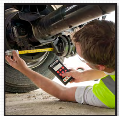
CONSISTANT BRAKE APPLICATION