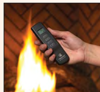
Thermostatic Modulating Remote Control -

Allows control of ON/OFF and High/Low Fire Settings