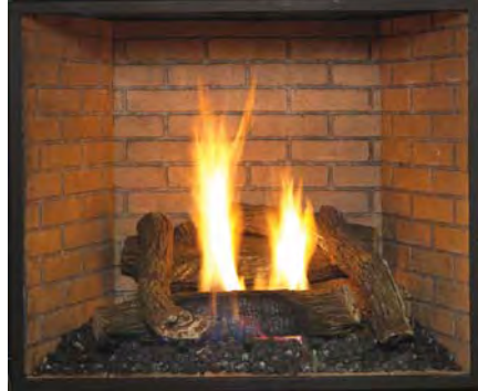
Weathered Brick Option