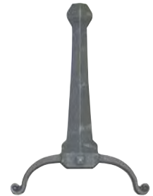
Wrought Iron Andiron