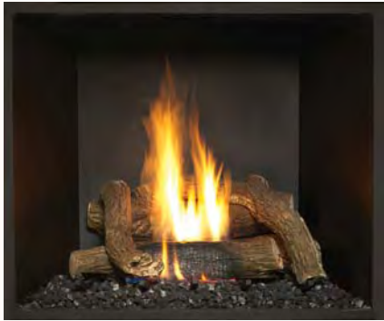
Standard Black Interior