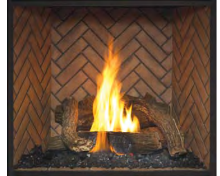
Herringbone Brick Option