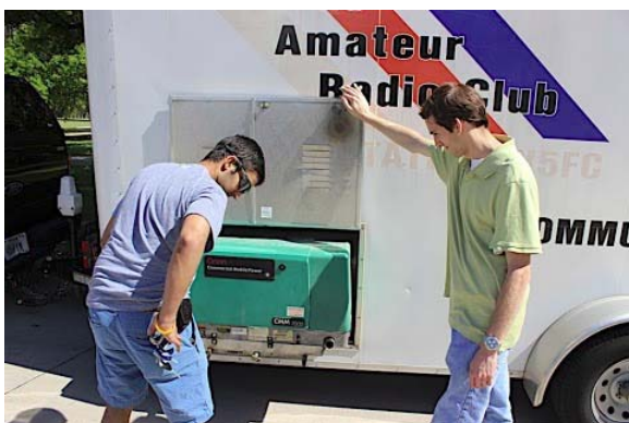
Training on how to properly start the generator

Tech Net is hosted by the DARC every Saturday night at 7:00 p.m. on 146.88 MHz with a PL Tone of 110.9.