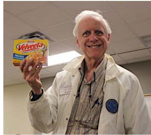
Door Prizes, Or Is It?

We have older editions to post – stay tuned!