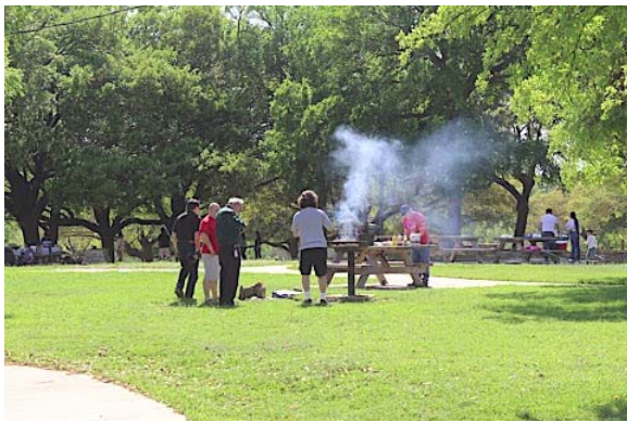
There were new cooks this year. Boy, oh boy, the smoke!

And then I had to give cooking lessons on the proper way to cook a hot dog – burn it! The hot dogs started moving out of the holding pan in a hurry afterwards. Someone snuck in Fritos and cookies – a strange combination but it worked.