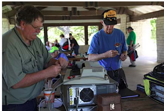
High-Techsters at Work on the Hill

We had representation from Dallas OEM with CERT, RACES, Texas National Guard, DARC Generator repairmen, and individuals set up with their radios, phones and analyzer units