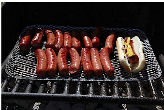
The presentation was great!

And then I had to give cooking lessons on the proper way to cook a hot dog – burn it! The hot dogs started moving out of the holding pan in a hurry afterwards. Someone snuck in Fritos and cookies – a strange combination but it worked.