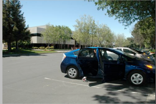
Test Car in lot being set up

Before the participants arrived for any session, the researchers verified protocol and that the test car and recording equipment is set up for the new participant.