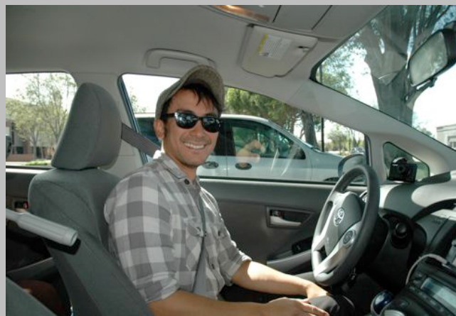
Survey interview and feedback gathering finishes off the sessions

The procedure ended with a feedback session, conducted in a similar fashion as the other user protocols, but with a focus on display preferences and value of the interface for the user.