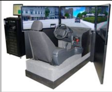
Simulator set-up in the lab room

The researcher then informed the participant that the session activities were complete and that their feedback would be collected. The simulator then brought up the survey questions. The participant then read the screen. In addition, the researcher verbally read out the questions twice. The participant responded verbally.