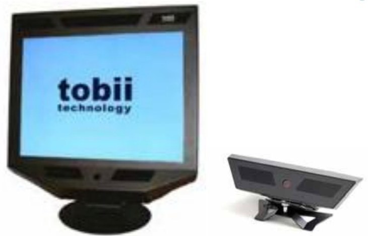
Eye tracker installable on computers