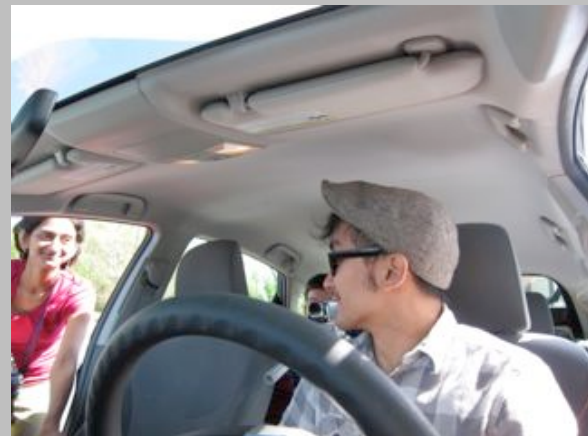
Greeting the participant

What follows is an overview of 3 separate protocols for each kind of user. (Appendix I has the modified protocols)