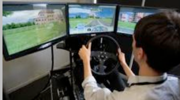
Participant drives the simulator in the free-form session, and the designated route for the goal-based activity