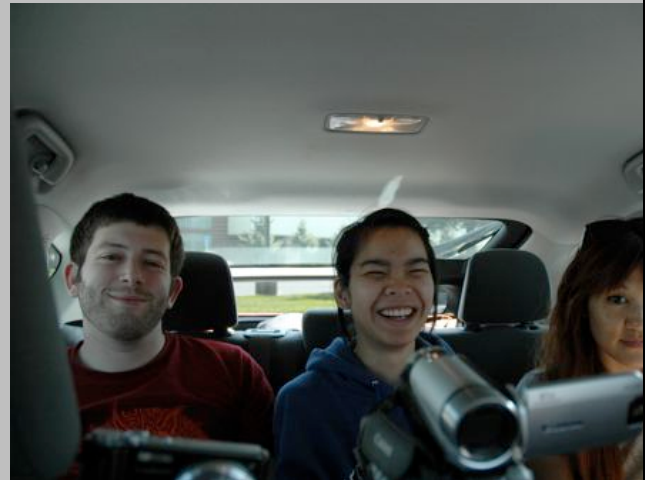
The back seat research team

The verbal response of the participants was also recorded on 2 researcher logs: One capturing behavior and time stamping key sections, and other log recording answering participant's answers to questions posed.