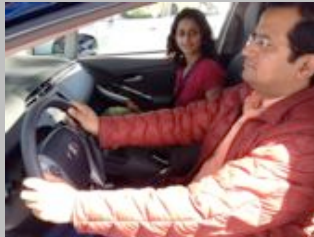
Participant answers probes during driving task

The moderator then informed the participant the session activities were complete and that their feedback would be collected. The researcher