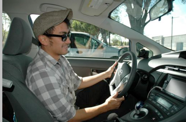
Participant answers questions about the interface in parked mode

The order of activities was also different: the goal-based activity came first followed by the task-based, the freeform activity, and finally feedback gathering.