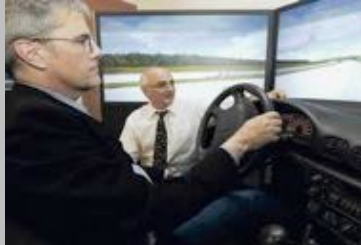
Researcher asks the participants questions about the interface and their subjective responses