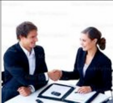
All sessions completed!

The researchers then saved all recordings and begin set-up for the next participant.