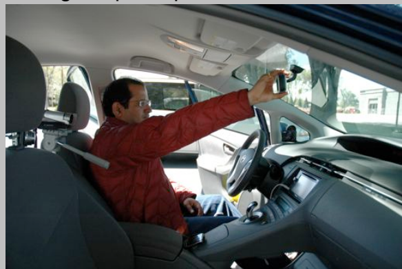
Participant gets settled into the test car