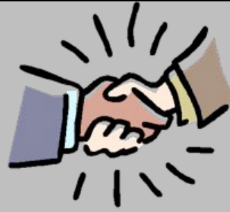
All sessions completed!

The researchers checked all recordings and began set-up for the next participant.