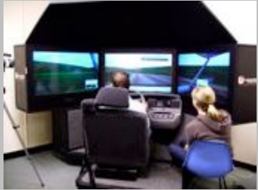
Researcher with Prius user: Interview about the interface followed by goal-based driving activities on the simulator.

The procedure then ended with a feedback session, conducted in a similar fashion as the other user protocols, but with a focus on display preferences and value of the interface for the user.