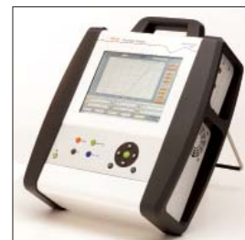
Shown with stand

denk-stein:net MEASUREMENT TECHNOLOGY Kaiserin-Augusta-Allee 8 ■ 10553 Berlin ■ Germany ☎ +49-(0)30-398981-0 ☎ +49-(0)30-398981-39 ✉ sales@denk-stein.com 🌐 www.denk-stein.com Vertrieb & Systemintegrator für Carrier + Corporate Networks