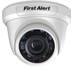
IR Dome Camera*