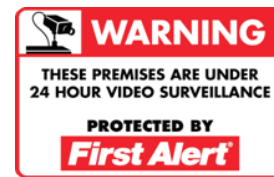
Protected by First Alert Stickers (3)