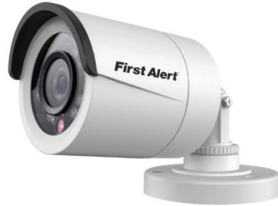
IR Bullet Camera*