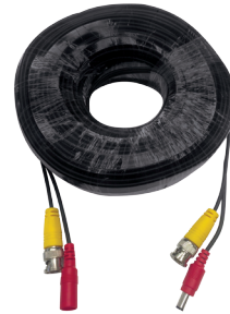
BNC Cable with Video and Power