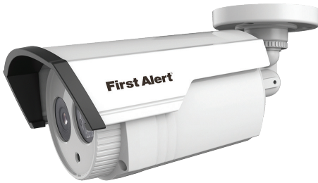
IR EXIR Bullet Camera*