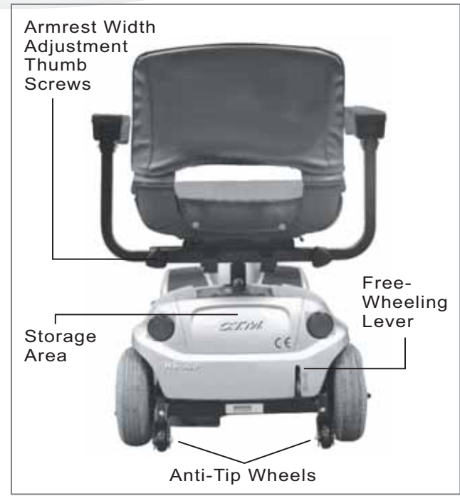
Figure 3 - HS-360 Back View