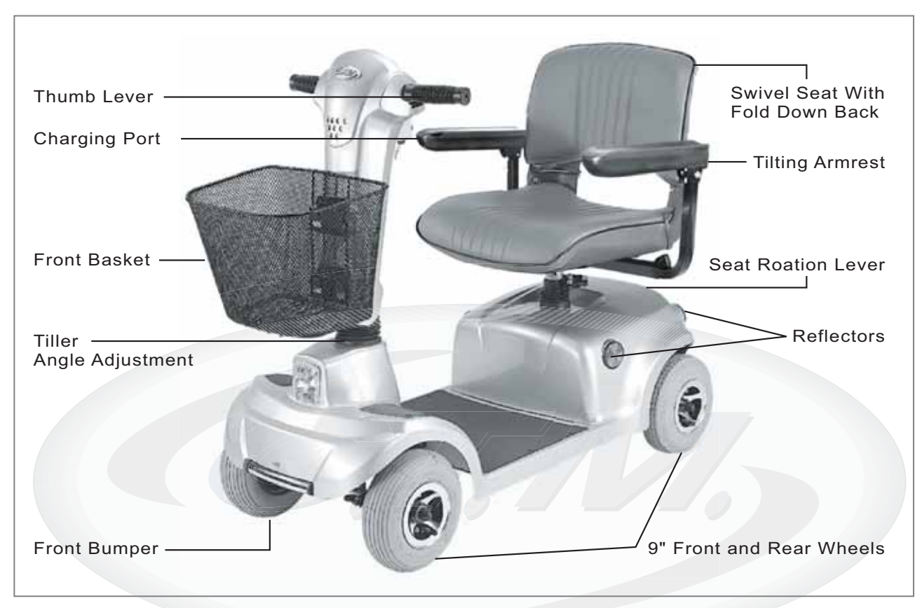
Figure 1 - HS-360 Front View

Before attempting to drive this scooter on your own, it is important that you familiarise yourself with the controls, and how to operate them.