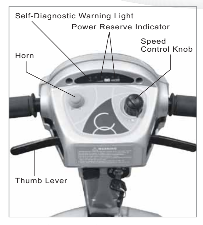
Figure 2 - HS-360 Top Control Panel