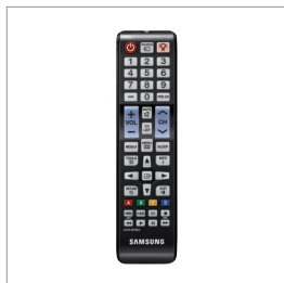
Universal Remote Control