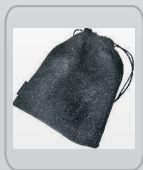
Soft black velvet carrying bag