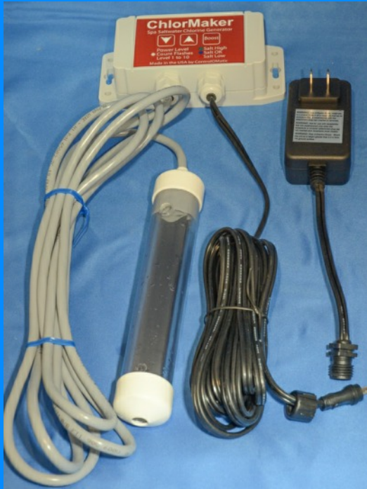
ChlorMaker DO (Drape Over)