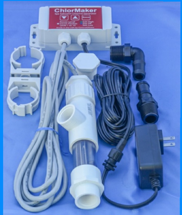
ChlorMaker IL (In-Line)