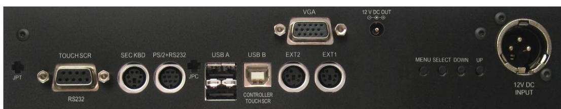
Figure A.2 Powered FREE+ 15 Connectivity (variant without audio option)