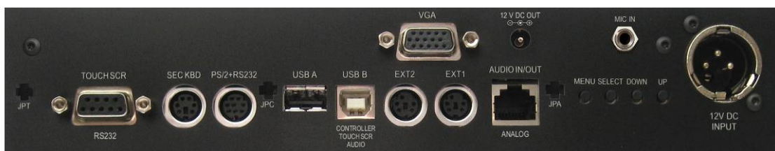
Figure A.1 Powered FREE+ 15 Connectivity (variant with audio option)

This approach results in two possible variants of the 15.0” Powered FREE+ module. First one comprises all the possible features while the other one lacks only the internal audio option (two built-in loudspeakers and associated electronic circuitry).