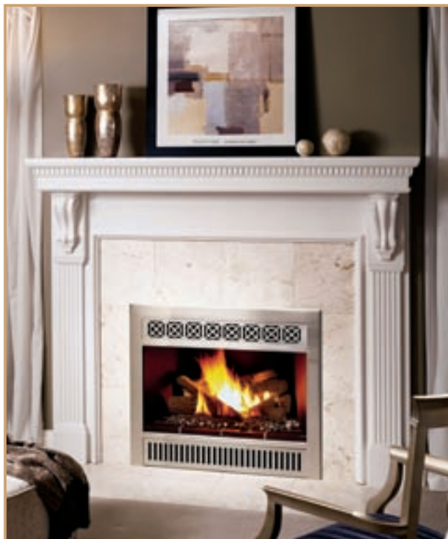
Neo Classic™ - Brushed Nickel finish