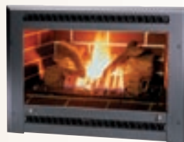
Metropolitan Collection™ Black Painted Finish