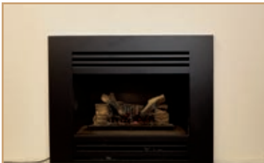
35 Custom Builder Standard Square - Bayswater Face Black Painted Finish