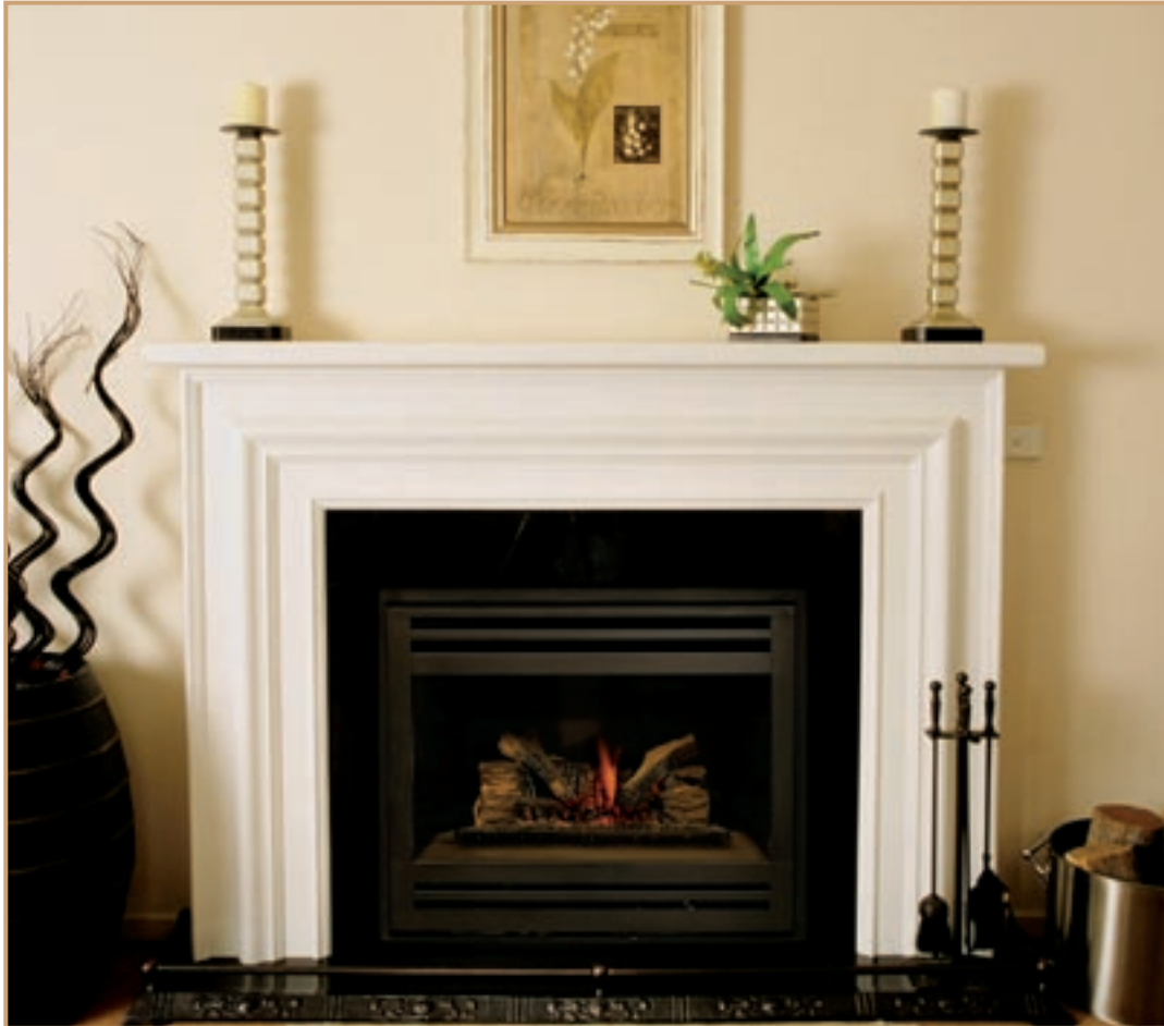
35 Custom Builder Standard Square - Black Painted Finish