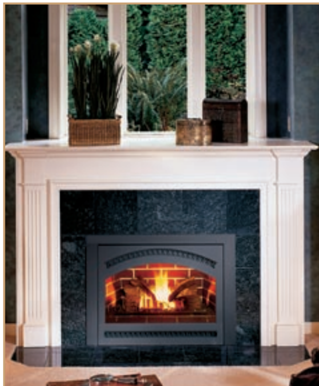
35 Custom Builder Standard Arch™ - Black Painted Finish