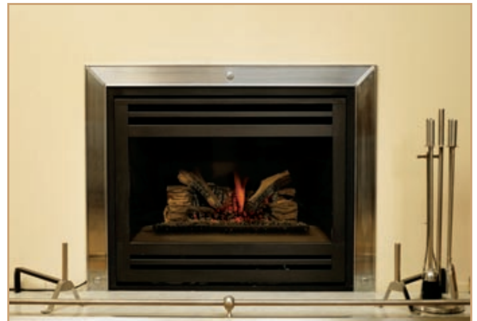
35 Custom Builder Standard Square - Black Painted Finish with 3 Sided Brushed Aluminium Fascia