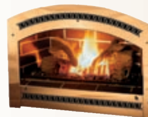
Classic Arch™ - 24 Karat Gold Plated - Black Painted Finish