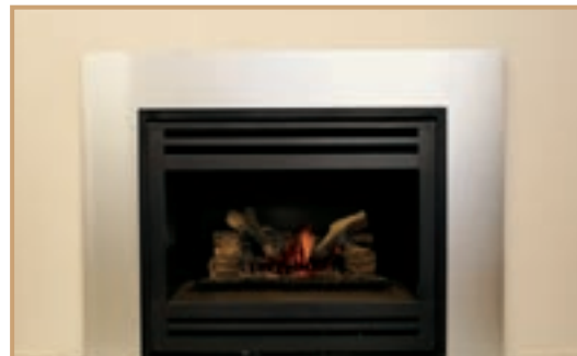
35 Custom Builder Standard Square - Black Painted Finish with 3 Sided Stainless Steel Fascia