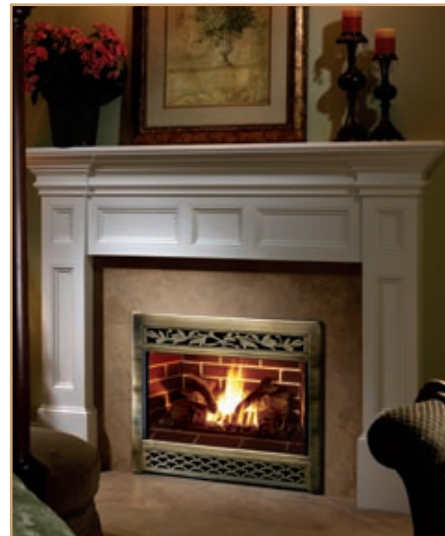
French Country™ - Antique Gold Finish