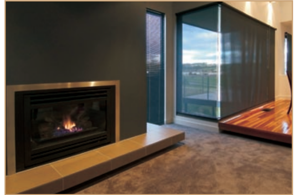
35 Custom Builder Standard Square - Black Painted Finish with 3 Sided Stainless Steel Fascia