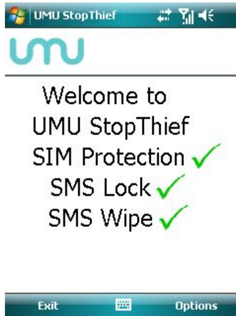
Figure 7 Main screen

The main screen shows you the whether SIM protection, SMS Lock and SMS Wipe functionalities are enabled.