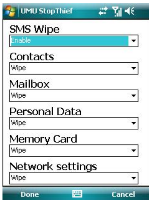
Figure 11 Wiping settings

You can enable or disable SMS wipe; with SMS wipe enabled you can send your phone an SMS containing your password and it can wipe your phone of data as per your preferences. You can specify what is wiped by UMU StopThief when your phone is lost or stolen by choosing wipe or leave for each option. The options are contacts, mailbox, personal data and memory card.