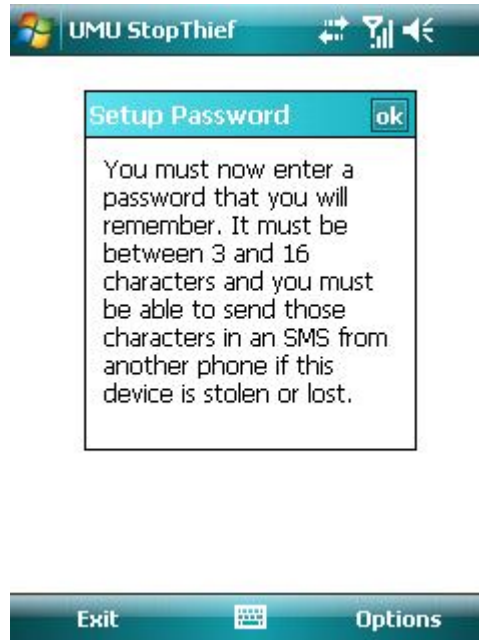
Figure 5 Setup

The first time UMU StopThief is run, you are asked to set the password up; press “ok” to set up your password.