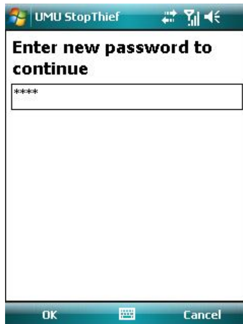
Figure 6 Setup password

Enter your password and press “Ok” to continue.