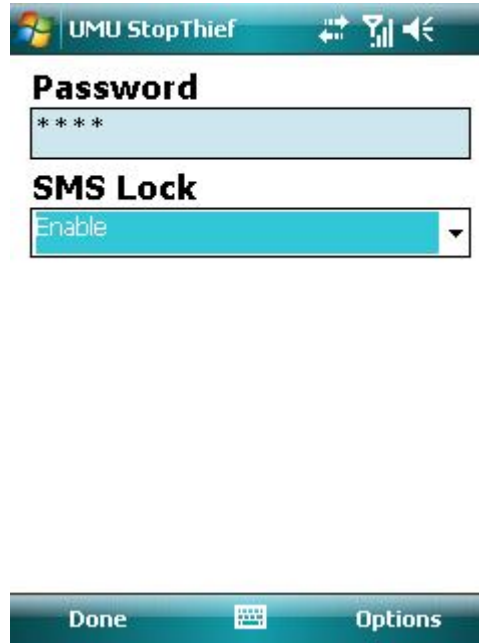
Figure 9 General settings

From here, you can change your password and enable or disable the SMS Lock functionality. With SMS Lock enabled, you can send your phone an SMS containing your password and it will lock the device remotely. Once locked, your handset can only be unlocked by entering the password.