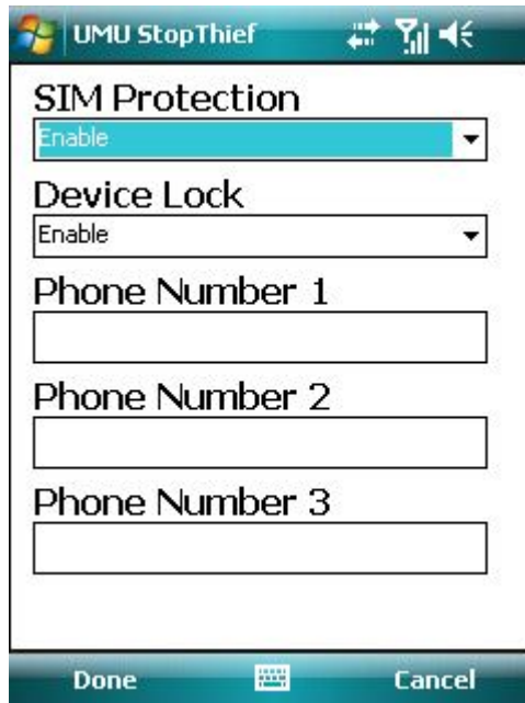
Figure 10 SIM protection settings