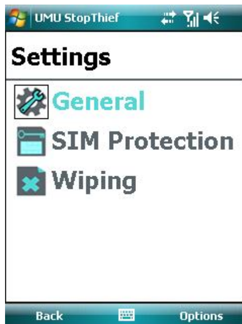
Figure 8 Settings

You can reset your password, enable or disable the SMS lock, SIM protection and Device lock functionalities, and how UMU StopThief behaves in the event your phone is stolen. In the main screen, select “ Options ” and select “ Settings ”, this opens the settings menu. From here, you can choose to go to general, SIM protection, or wiping settings.