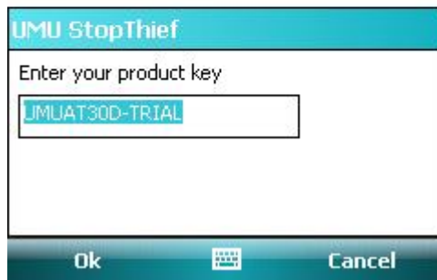
Figure 2 Enter product key

Once a valid product key has been entered, the End User License Agreement is displayed and you have two options: