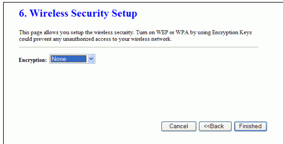
Screen snapshot – Wireless Security Setup

This page is used to configure wireless security