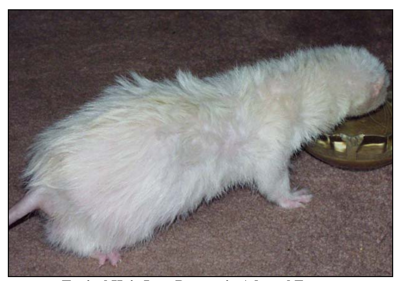
Typical Hair Loss Pattern in Adrenal Ferrets (Note the hair loss at the base of the tail and the tops of the rear feet)

This disease is more dangerous in the male ferret than the female, although it does not seem to occur as frequently. In the male ferret, the adrenal tumor may cause the prostrate tissue to enlarge and close off the urethra, preventing urination. This can quickly lead to death. If you see him make frequent trips to the litter box but with no production of urine, RUSH him to a vet immediately.