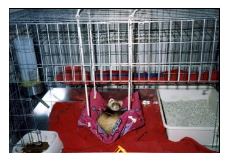
Typical Cage Setup

Small area rugs, sweatshirts, etc. will provide a soft sleeping area and allow the ferret to "tunnel in" for sleeping. Watch that your ferret's nails aren't split or long such that they catch on the material. Terry cloth and similar material may snag on the nail and cause serious injury as the ferret struggles to free itself. If you use a cloth material for bedding or flooring, be sure to check it periodically to make sure that the ferret is not eating the material and that the material is not unraveling. Long threads can wrap around a ferret and cause injury or death. Use those with caution. The bedding should be washed at least weekly. This significantly reduces the musky odor common to ferrets. Please don't use wood chips, wood shavings, or shredded newspaper for bedding as these create a breeding ground for bacteria. Cedar and pine chips release aromatic oils that are believed toxic to ferrets if they are in prolonged, close contact.