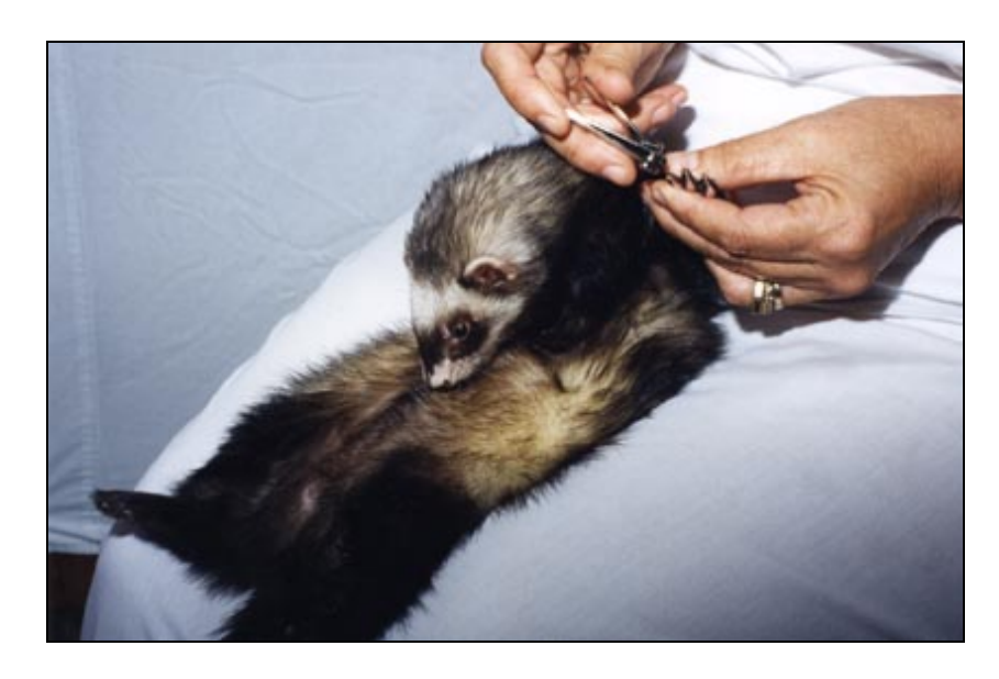
A couple drops of Ferretone on the belly makes nail clipping a snap

Use a regular human-type toenail clipper or the dog/cat type. Make sure it is sharp. Otherwise, it may cause the nail to split. Clip the nails such that the flat portion of the trimmed nail will be parallel to the floor when the ferret is walking. A couple quick strokes with an emery board to round off the edges of the nail after clipping will also prevent splitting, will make the nail smoother and less likely to snag on things.