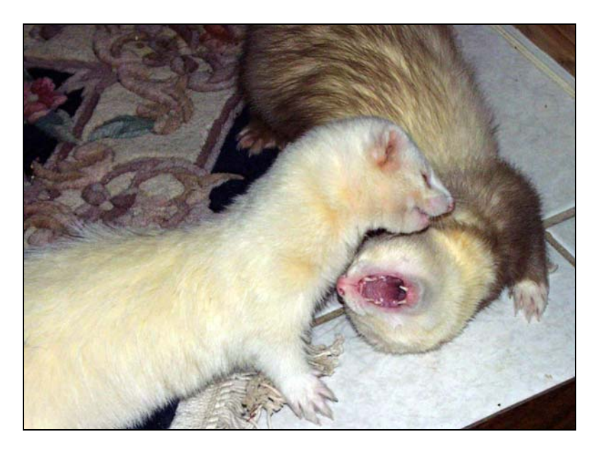
Doc and Ollie at "Play"