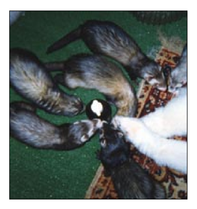
Ferrets love Ferretone This group surrounds the Ferretone bottle so that it won't get away

Ferretproofing - Some ferret owners claim that you can never <u>ferret-proof</u> your home, only make it ferret-resistant. Ferrets are intensely curious about everything. They can fit through very small openings. Unfortunately not every place they wish to explore is hospitable to small, furry animals - the underside of refrigerators, washers, dryers, dishwashers, stoves and ovens; the insides of walls and floors. Many places contain rotating machinery, open electrical terminals, flames, heating elements, drive belts, or just places to get lost in and not be able to find one's way back out.