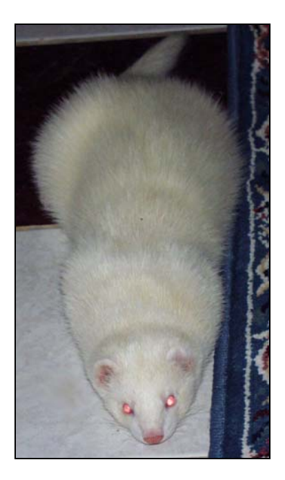
Doc doing his Flat-Ferret Pose

often used when sneaking up on something or someone. The problem is that it's difficult to tell when he wants attention, or wants to be invisible. Ignore a ferret asking for attention risks disappointing the ferret; picking up an "invisible" ferret risks ruining his game. I usually just pick them up. I've found that when they're trying to be invisible, it just means that they are about to get into trouble anyway.