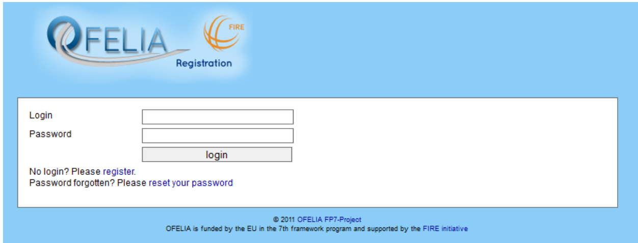
Figure 3: OFELIA Page for Login to OFELIA

Upon successful login, you will be directed to the OFELIA welcome page (see Figure 4) which contains the OFELIA OpenVPN configuration tarball, and the links to the manual (documentation wiki) and the OFELIA public website.