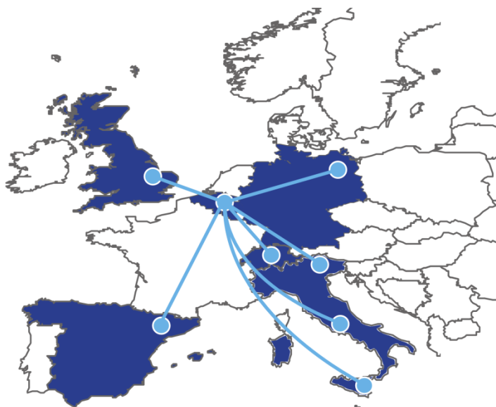
Figure 1: Map of OFELIA island locations in Europe

In the future, the OFELIA testbed will also support “Inter-Federation” procedures that enable resource export and import across with other large scale test-bed facilities. In particular, OFELIA is working to inter-federate with GENI, PlanetLab, OMF 1 .