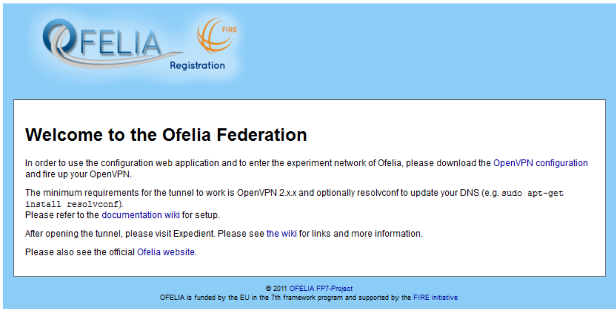
Figure 4: OFELIA Experimenters Welcome Page

Upon successful login, you will be directed to the OFELIA welcome page (see Figure 4) which contains the OFELIA OpenVPN configuration tarball, and the links to the manual (documentation wiki) and the OFELIA public website.