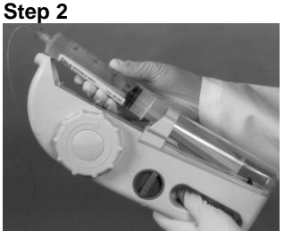
Load the prefilled syringe; tubing attached, with gradations facing up, plunger first into the syringe shield. Make sure the tubing luer disc is fully seated in the pump's nose.