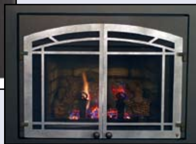
Sun Prairie with Cabinet Doors shown in Hammered Pewter. Also available in Black. →