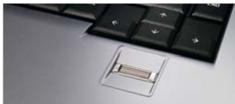
Fingerprint Reader: secure and convenient single touch sign-on