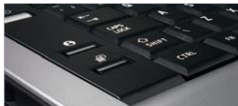
Toshiba Assist and Presentation Button: instantly launch tools and presentations