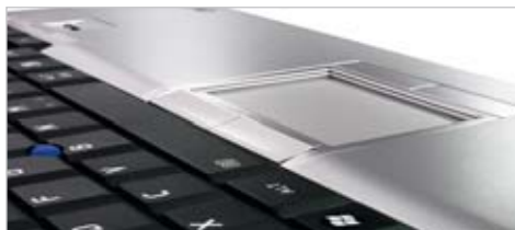
Toshiba Dual Pointing Device: featuring AccuPoint™ II and Touch Pad for optimum flexibility