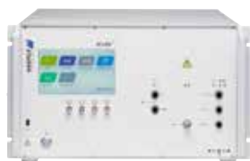
AXOS 8 Compact Test System Article no. 2490800

Surge 1.2/50 \mu s...8/20 \mu s IEC/EN 61000-4-5