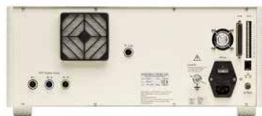
AXOS 5 rear view