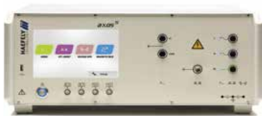
AXOS 5 front view

A wide range of cost-efficient and user friendly coupling / decoupling networks for power lines as well as for symmetrical and asymmetrical data- and signal lines are available as options.