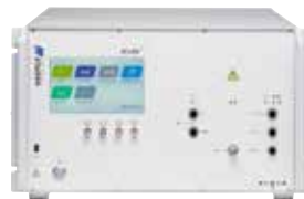
AXOS 8 Surge Test System Article no. 2490810

Surge 1.2/50 \mu s...8/20 \mu s IEC/EN 61000-4-5