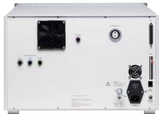
AXOS 8 rear view