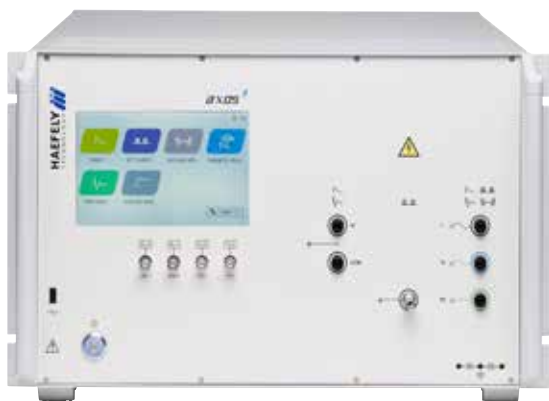
AXOS 8 front view

A wide range of cost-efficient and user friendly coupling / decoupling networks for power lines as well as for symmetrical and asymmetrical data- and signal lines are available as options.