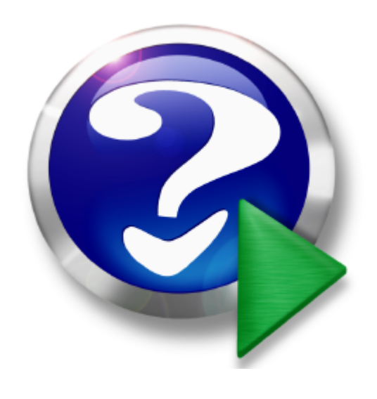
DF SDK User Manual

© 2002 - 2008 by AgenSoft, all rights reserved