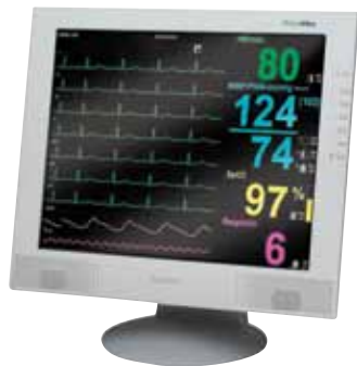
008-0937-00 17" Color display for Propaq® LT interface