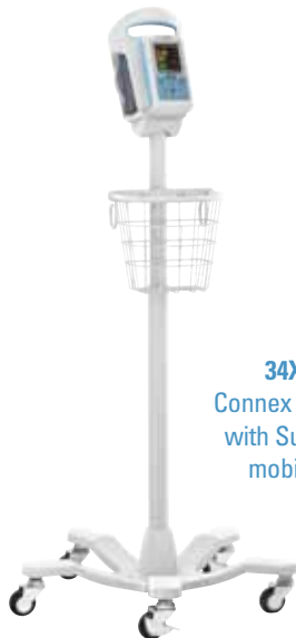
34XFST-B Connex ProBP 3400 with Sure BP and mobile stand