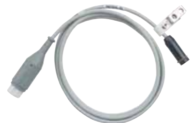
008-0735-00 Adaptor Cable, Micropaq®-to-HP Propaq®, 6'