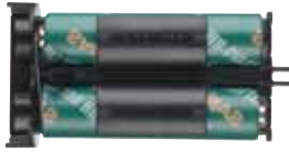
53020-0000 Rechargeable Battery Pack for Braun PRO 4000