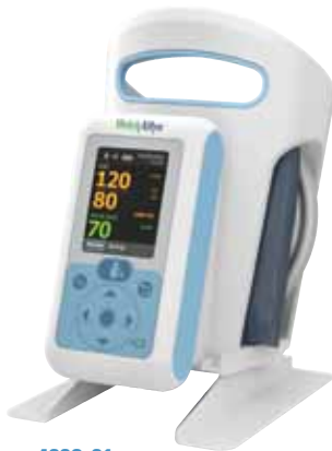
4602-61 Desk Mount with basket for Connex ProBP 3400