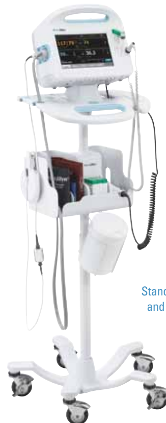
Stand with monitor and accessories