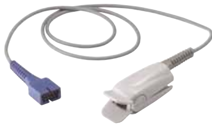
900-0021-00 DS-100A Durasensor Adult Oxygen Transducer