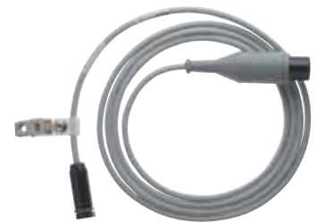
008-0734-00 ECG Adaptor Cable, Propaq® LT or Micropaq to Propaq, 6'