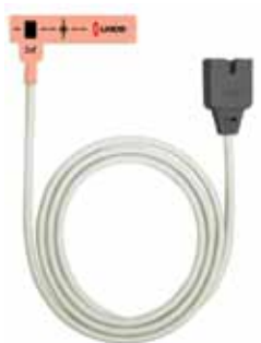
LNCS-PDTX Pediatric Adhesive Sensors