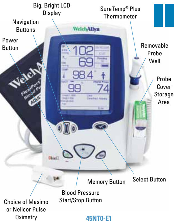
45NT0-E1 Spot Vital Signs® LXi with SureBP®, Nellcor SpO 2 , and SureTemp Plus Thermometer