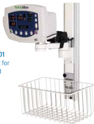
008-0834-01 Wall Mount for VSM 300