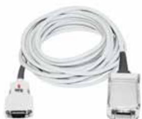
LNC-4 LNC Patient Cable (Masimo)