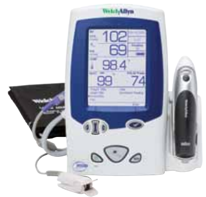
45NE0-E1 Spot Vital Signs® LXi with SureBP®, Nellcor® SpO 2 , and Braun® ThermoScan® PRO 4000 Ear Thermometer