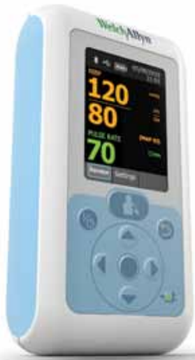
34FHT-B Connex ProBP 3400 with Sure BP, Handheld