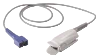
DS-100A DuraSensor Adult Oxygen Transducer (Nellcor®)