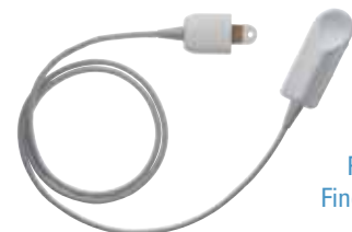
008-656-00 Pediatric Reusable Finger Sensor (Masimo)