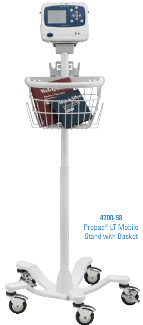
4700-58 Propaq® LT Mobile Stand with Basket