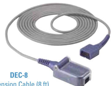
DEC-8 Extension Cable (8 ft) (Nellcor)