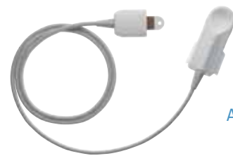
008-0648-00 Adult Reusable Finger Sensor (Masimo)