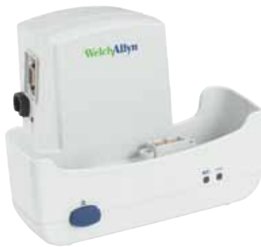
008-0931-00 Charging/Communications Cradle with USB with Large Color Display Interface