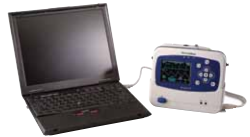
802LT0N-UE1 Propaq® LT/Charging Cradle/USB Port - 120NA (Laptop not included)