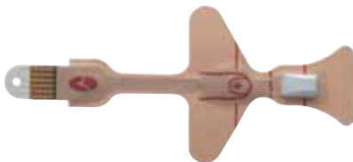
LNOP-PDT Pediatric Disposable Adhesive Finger Sensor (Masimo)