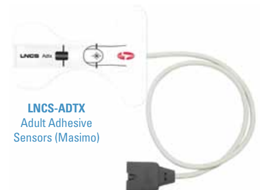
LNCS-ADTX Adult Adhesive Sensors (Masimo)