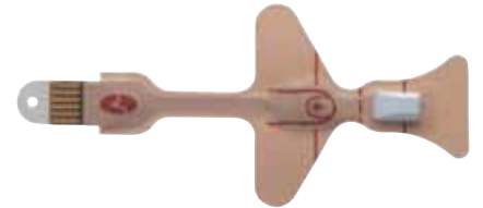
008-0654-00 Pediatric Disposable Adhesive Finger Sensor (Masimo)