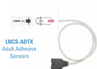
LNCS-ADTX Adult Adhesive Sensors