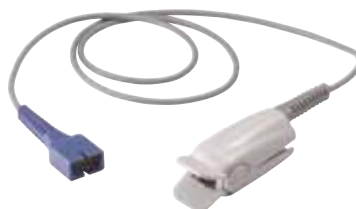
DS-100A Durasensor Adult Oxygen Transducer (Nellcor)