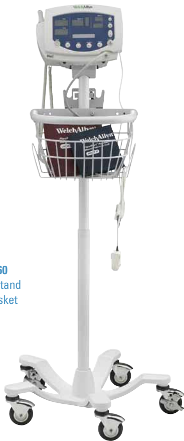
4700-60 Mobile Stand with Basket