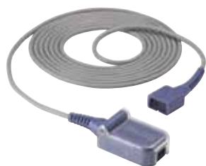
DEC-8 8 ft Differential Extension Cable, Pulse Oximeter Sensor (Nellcor®)