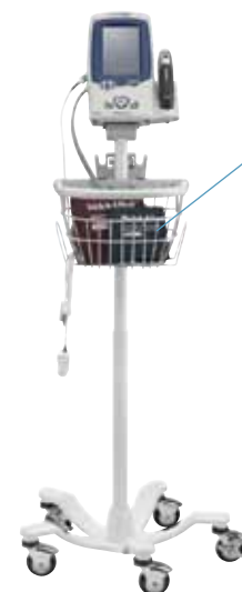
4700-60 Mobile Stand with Basket