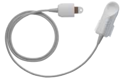
008-0648-00 Masimo® - LNOP-DCI Adult reusable sensor (Masimo)