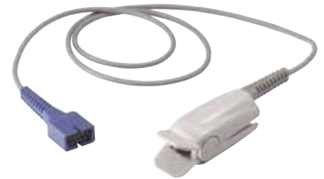
900-0021-00 DS-100A Durasensor Adult reusable sensor (Nellcor)