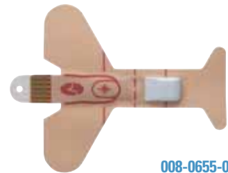
008-0655-00 Adult Disposable Adhesive Finger Sensor (Masimo)