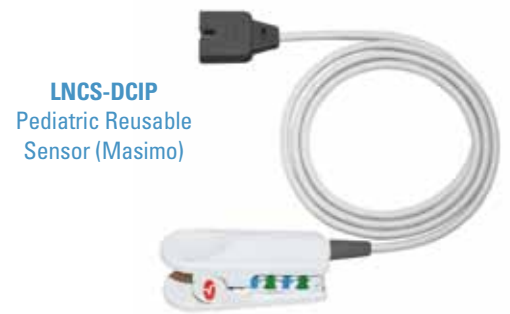
LNCS-DCIP Pediatric Reusable Sensor (Masimo)