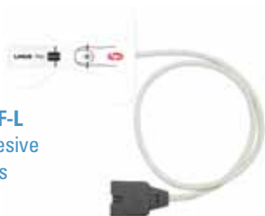
LNCS-INF-L Infant Adhesive Sensors