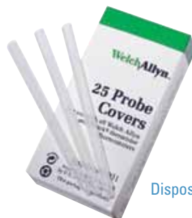
05301-101 Disposable Probe Covers