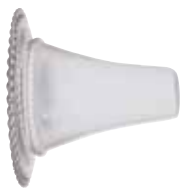
05075-800 Disposable Probe Covers for Braun PRO 4000