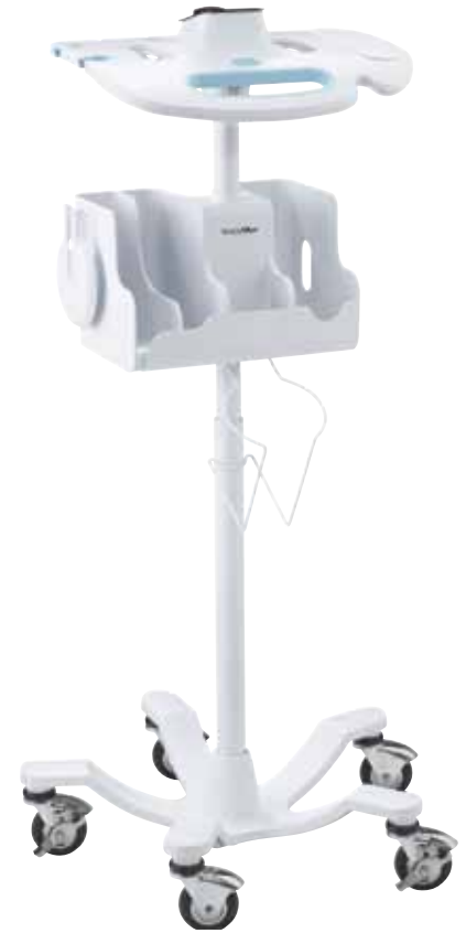
4800-60 Accessory Cable Management Mobile Stand

4800-60 Accessory Cable Management Mobile Stand 4800 Series