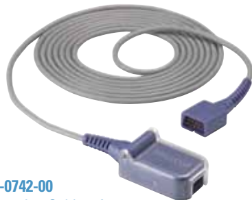
008-0742-00 Nellcor® Extension Cable 8 ft