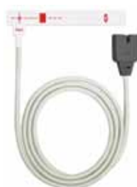
LNCS-NEOPT-L Neonatal Adhesive Sensors (Masimo)