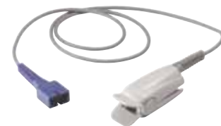
DS-100A Durasensor Adult Oxygen Transducer (Nellcor)