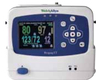
Propaq® LT with Wireless Option/ Charging Cradle - 120 NA