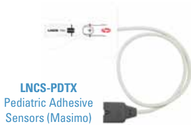
LNCS-PDTX Pediatric Adhesive Sensors (Masimo)