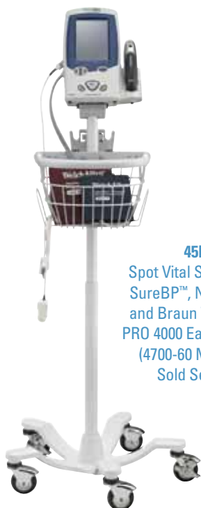
45NE0-1 Spot Vital Signs® LXi with SureBP™, Nellcor® SpO 2 , and Braun ThermoScan® PRO 4000 Ear Thermometer (4700-60 Mobile Stand Sold Separately)

450T0-E1 Spot Vital Signs LXi with SureBP and SureTemp Plus Thermometer