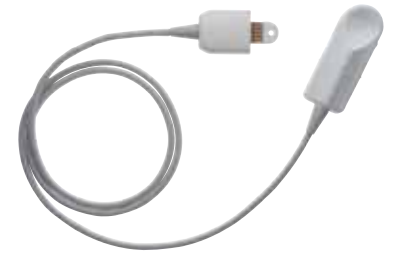
008-0656-00 LNOP-DCIP Pediatric Reusable Sensor (Masimo)