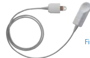
LNOP-DCIP Pediatric Reusable Finger Sensor (Masimo)