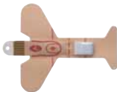
LNOP-ADT Adult Disposable Adhesive Finger Sensor (Masimo)