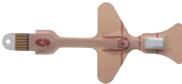
LNOP-PDT Pediatric Disposable Adhesive Finger Sensor (Masimo)