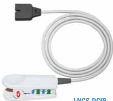
LNCS-DCIP Pediatric Reusable Sensor (Masimo)