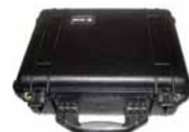
4500-100 Spot Carrying Case