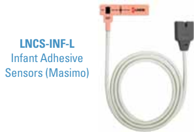
LNCS-INF-L Infant Adhesive Sensors (Masimo)