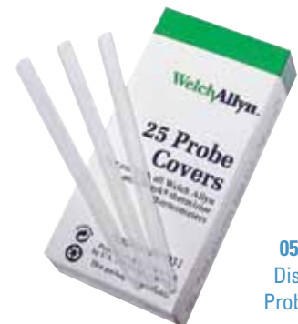
05031-101 Disposable Probe Covers