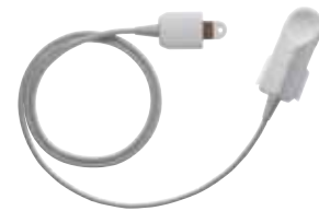
LNOP-DCI Adult Reusable Finger Sensor (Masimo)