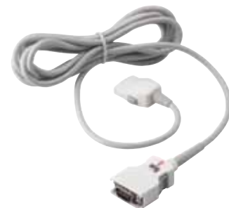
PC-04 4 ft Cable with Sensor Connector (Masimo)