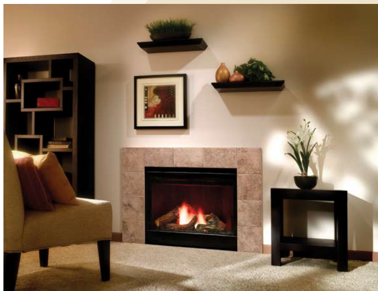
Eclipse Direct Vent System shown with custom tile surround