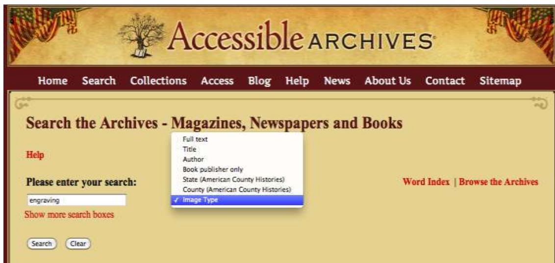
Image Type searching is available only in Godey's Lady's Book .

There are three ways that an Image Type search can be done: