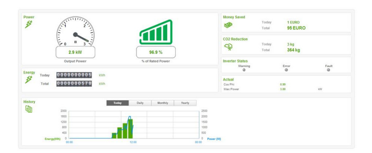
Figure 5 – Dashboard of Ethernet card web pages

The important information represented in the dashboard is: