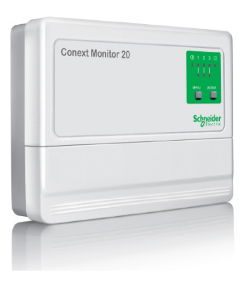
Figure 6 - Conext Monitor 20

As shown in Figure 7 below, connecting the Conext Monitor 20 to the Internet via Ethernet allows the operating data to be visualized and monitored regardless of the location using the web portal.